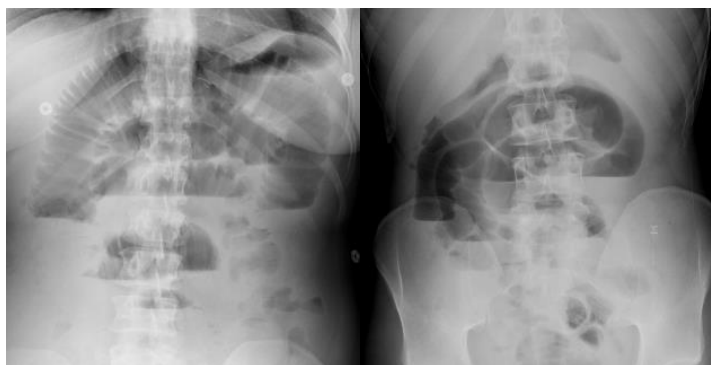
Figure 1: A plain abdominal X-ray film showed dilatation of small bowel loops and the presence of multiple air-fluid levels.

Surgical exploration revealed the presence of a small bowel volvulus secondary to an adhesion band between the ovary and the small intestine responsible if an intestinal distension located 1.3 m upstream of the ileocecal valve, without visible necrosis. A lysis of the adhesion was performed, with a small bowel reduction and retrograde evacuation of the proximal segment (figure 3). The postoperative period was uneventful; the patient was discharged on postoperative day four.