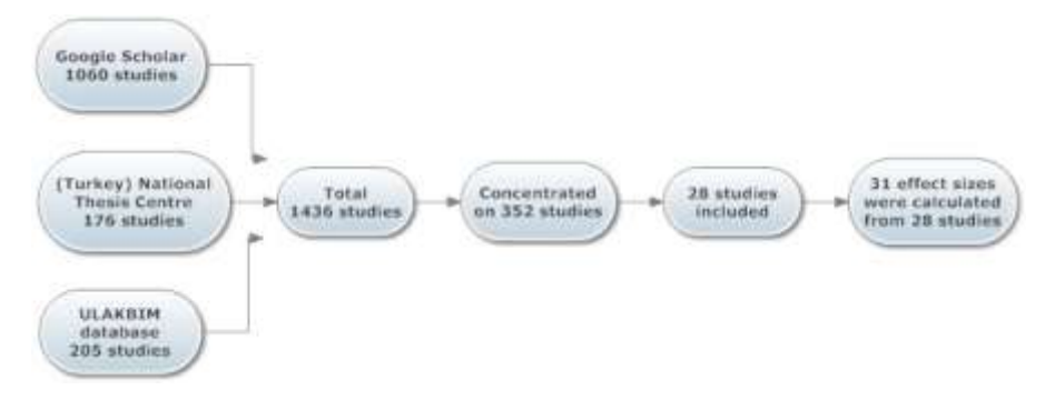
Figure 1. Flow Chart Showing Selection of Studies for Meta-Analysis

As a result of the classification of the total of 1,436 publications reached by the last search on the 20th of January 2017 according to aforementioned criteria, this study concentrated on the remaining 352 studies. An e-mail was sent to the authors of the studies that met the selection criteria but were not accessible; however, the authors did not respond to e-mails. Twenty-eight studies comprising of theses and peer-reviewed articles involving an experimental analysis of the effect of learning strategies on students' achievement were included in this study. Thirty-one effect sizes were calculated in total, and analyses were conducted with these 31 effect sizes as there was more than one experimental group in three of the studies. Apart from these 28 studies, no other studies were found to provide sufficient data and meet the necessary requirements in the form of a full-text paper or poster presentation.