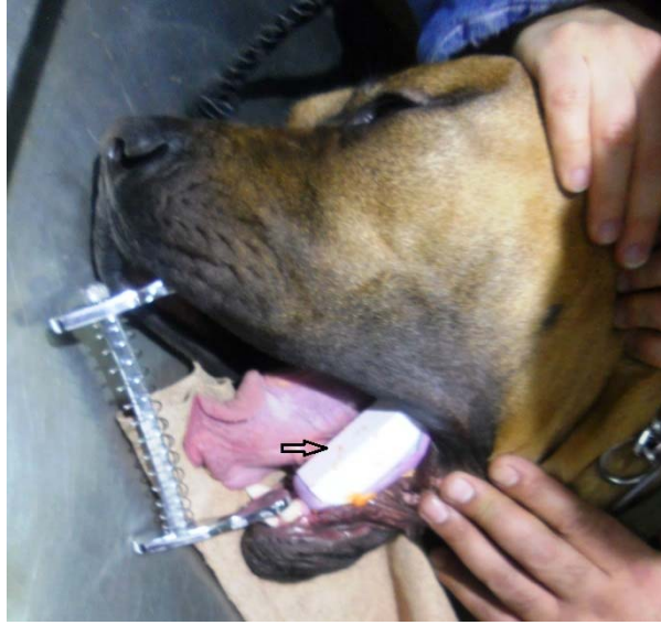
Figure-4. View of tooth mold (arrow) on the left mandible.