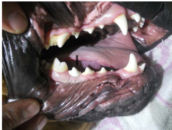
Figure-5. View of ceramic implant tooth(arrow) on right mandible.