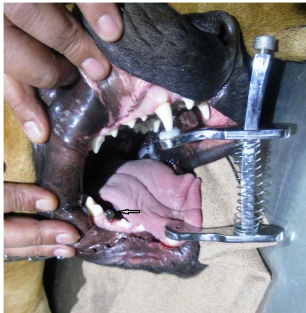
Figure-3. View of implant and cover screw (arrow) on the right mandible.

Transfer was placed right mandible. Two stage tooth mold was done by silicone gel (zeta plus, Italy) with 2 spatula. Mold of missing tooth was taken. Additionally, contrary P4 mold was also done (Figure 4). During a second procedure, the cover screw was lifted from implant, and the collar-retaining screw and collar were enclosed and squizzed with a small screwdriver and the anti-torque wrench. Next, the coping-retaining screw and coping were attached, the latter being squizzed minimally. Abudment was added on implant. After abudment was covering by teflon tape and tempit item. Abudment was applied by anticeptic and saliva was cleaned from area. Ceramic implant tooth was placed and fixed by dental acrylic (Aifix) (Figure 5). Radiographs were taken pre-operatively and immediately postoperatively (Figure 6). Thereafter, radiographic follow-up was planned at the scheduled monthly examination.