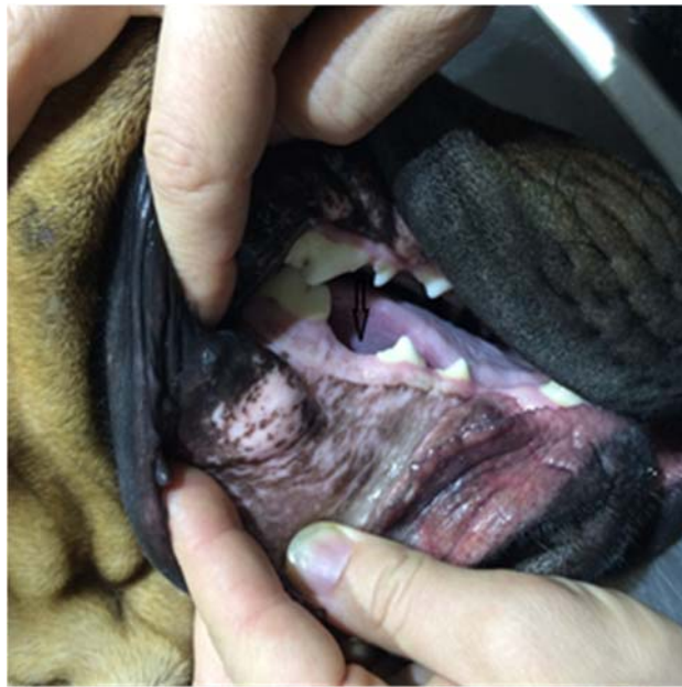
Figure-1. View of missing tooth on the right mandible (arrow).

A 1.5-year-old male Canary dog was referred to the surgery department for missing of a tooth (Figure 1). His owner was discontented to this esthetic problem. His body weight was 43 kg. All primary teeth were present except for the right mandibular fourth premolar (P4) at the time of the first dental examination. Mandibular oblique radiographs confirmed the finding of P4 hypodontia. The implant system take placed an endosseous component, hereafter referred to as the implant, a coping, a coping-retaining screw, a transgingival collar, and a collar-retaining screw (Niko Dental, Bad Elstam, Germany).