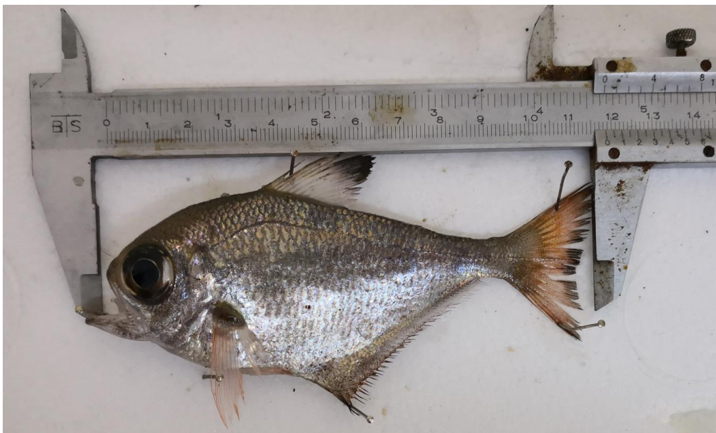
Figure 2. An individual of P. rhomboidea caught from Mersin Bay