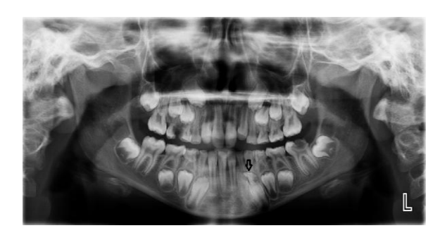
Figure 1. A supernumerary tooth preventing the erupsion of left mandibular lateral tooth

Supernumerary teeth, whether impacted or erupted, may remain in position for years without causing any disturbances and clinical manifestations. However, in some cases, they may cause some problems in neighboring teeth such as root resorption, delayed or abnormal root development, rotation or displacement of the adjacent teeth, dilacerations, eruption failure, crowding, malocclusion, fistulas and cystic formation. In the present study, one patients experienced eruption failure due to supernumerary teeth (Figure 1).