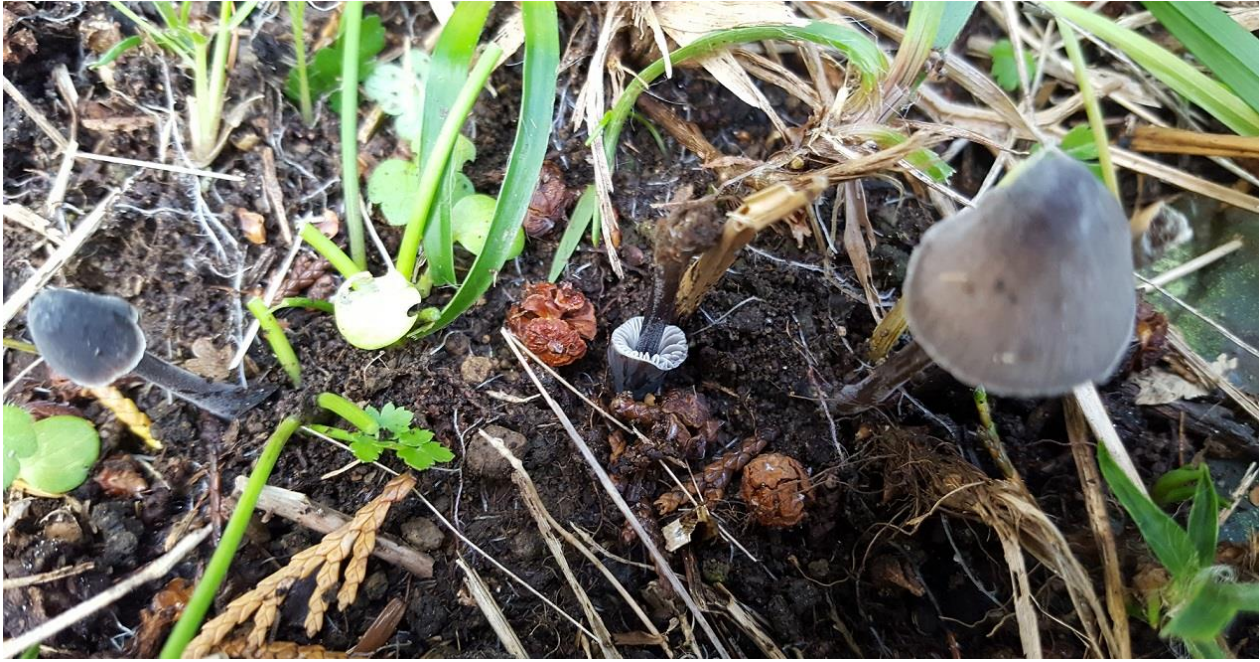
Figure 1. Basidiocarps of Mycena ustalis