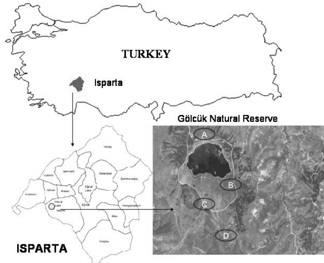
Figure 1. Map of the sampling sites.

community with Populus and Platanus spp. Delphinium venolosum , Paronychia davisii , Alcea apterocarpa , Marrubium vulgare , Satureja cilicica , Quercus coccifera , Sorbus umbellata , Berberis crataegina , Spartium junceum , Rosa canina , Iris sp. were common species for this site, where 18.8% of endemic plants were recorded (Fakir, 1998).