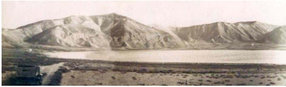
Figure 3. Gölcük lake view in 1956.