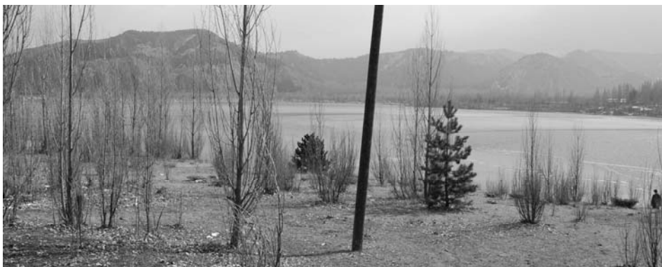
Figure 5. Gölcük lake view in 2008.

Tilman et al. (1994) reported that destroying an additional 1% of habitat caused eight times more extinction than in similar sized disturbed habitat. It's fact that species with small population sizes will suffer most.