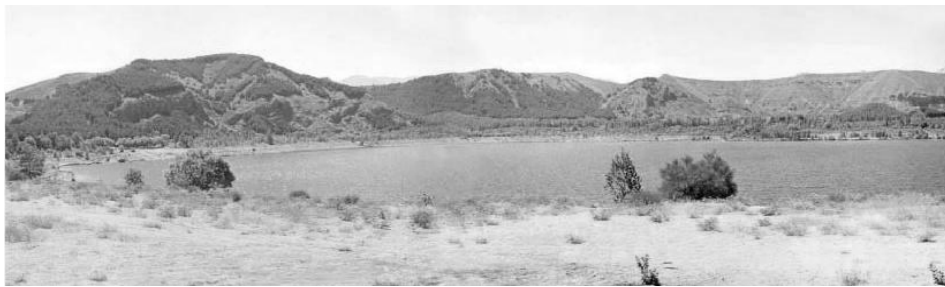
Figure 4. Gölcük lake view in 1999.