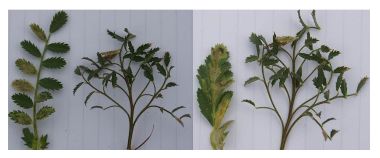
Figure 2. ILC 3397 (leaf miner susceptible control), AWC 612-1M (leaf miner resistant mutant), Sierra (Leaf miner susceptible control) and AWC 612-1M, respectively (from left to right).