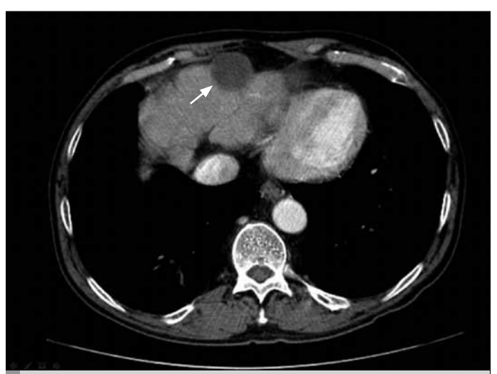
Figure 2. Computed tomography sections of the liver revealing a hydatid cyst occupying the left lobe of the liver (arrow)

most importance because of the risk of cerebrovascular events and pulmonary edema. There is a report in the literature that presents stroke as a cause of cardiac hydatidosis (3). In our patient, the cardiac cyst originated in the left atrium and did not involve the mitral valve orifice area. Sometimes, left atrial myxomas may mimic a hydatid cyst or vice versa (4, 5). To the best of our knowledge, multi-organ involvement including the liver and left atrium simultaneously has not been described before.