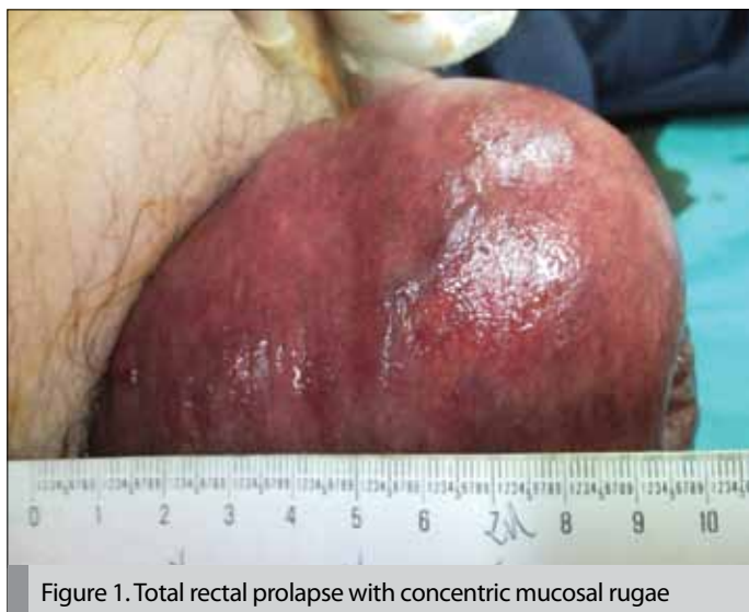
Figure 1. Total rectal prolapse with concentric mucosal rugae