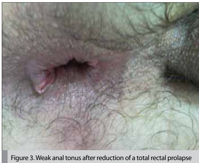
Figure 3. Weak anal tonus after reduction of a total rectal prolapse

aware of a rectal mass, except for some geriatric patients. In the early stages, the prolapse is raised upon defecation and reduces spontaneously. In progressive cases, prolapse can occur with simple daily activities and requires manual reduction. Patients usually complain of mucous drainage, hemorrhage, incontinence and pain. Rectal tonus is usually weak or absent. In a true rectal prolapse, the mucosal rugae are always concentric (3). In the emergency department, manual reduction of a rectal prolapse can be impossible due to extreme edema and pain. Blockage with local anesthesia, local ice and sugar administration or an elastic bandage over the prolapsed mass are some techniques used to facilitate manual reduction. Early reduction of a prolapse can reduce complication rates and enhance elective surgery. Manual reduction must not be attempted in cases with ischemia (1, 4).