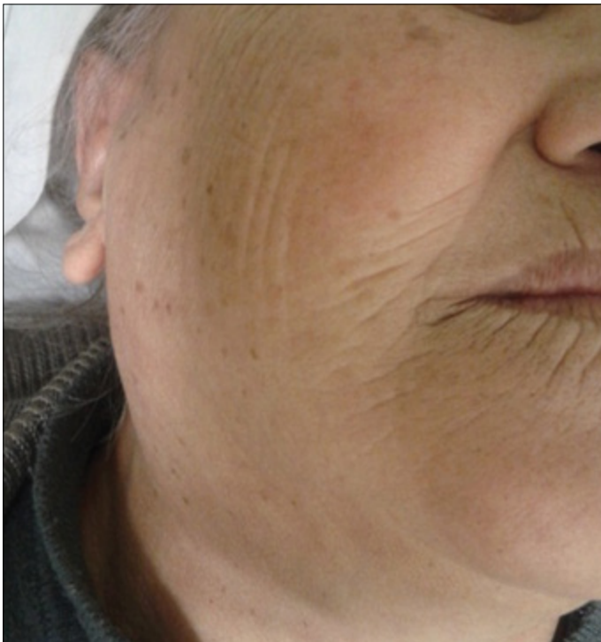
Figure 1. Swelling of the right parotid gland of the patient