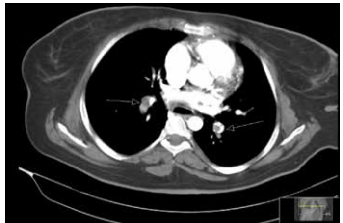
FIGURE 1. Thrombus in both pulmonary arteries

In the autopsy, external examination revealed widespread larva activity over the whole body, epidermal stripping, and yellow–black–red–brown color changes on the whole body; the eyeballs had lost formation because of decay, three pieces of blue suture material were observed on the mid-third of the posterior surface of the left thigh, and the stab wound injury was seen at a depth of 2.5 cm, in-