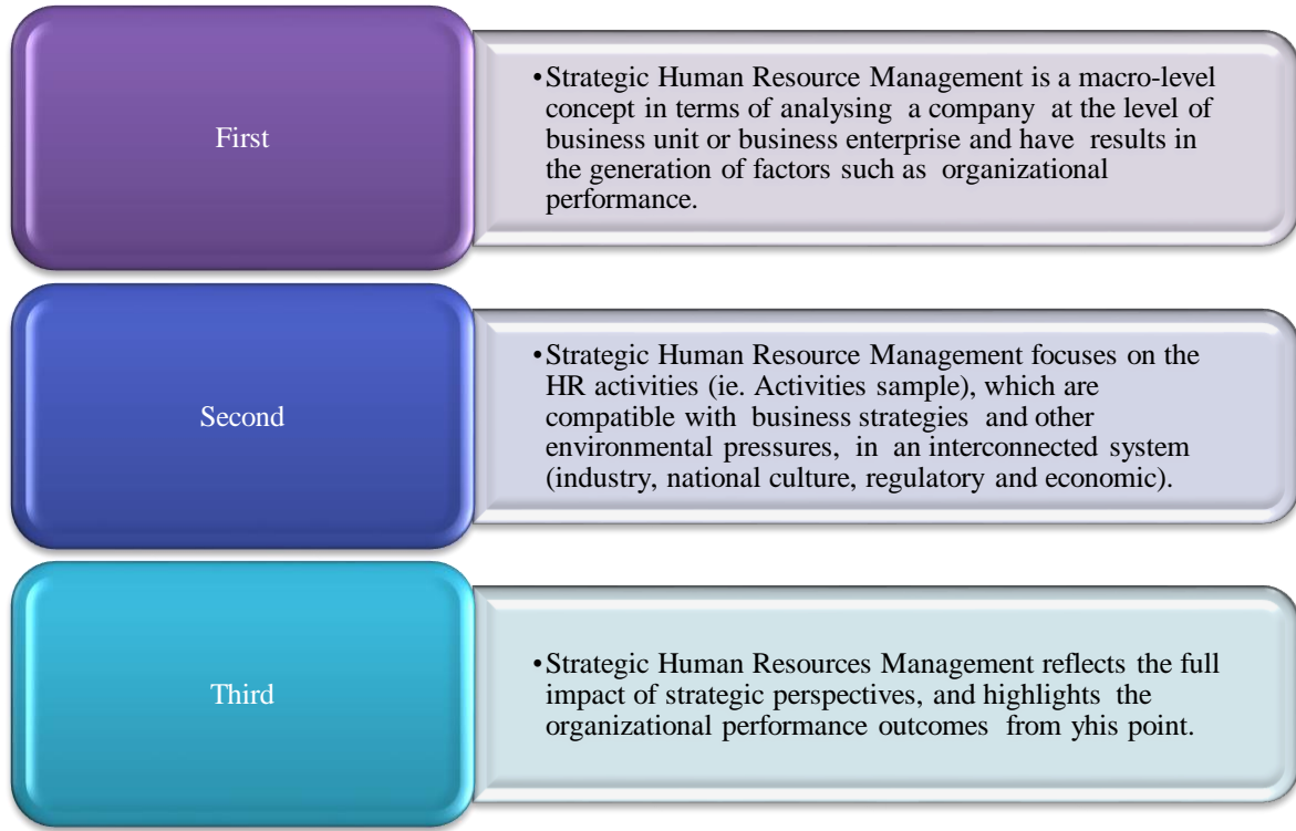
Figure 1. Features of Strategic Human Resource Management