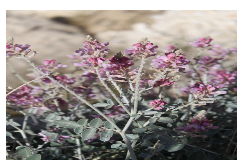
Figure 3. General view of plant.

Fl. 5-6. Stony and calcareous slopes, 970-1030 m.