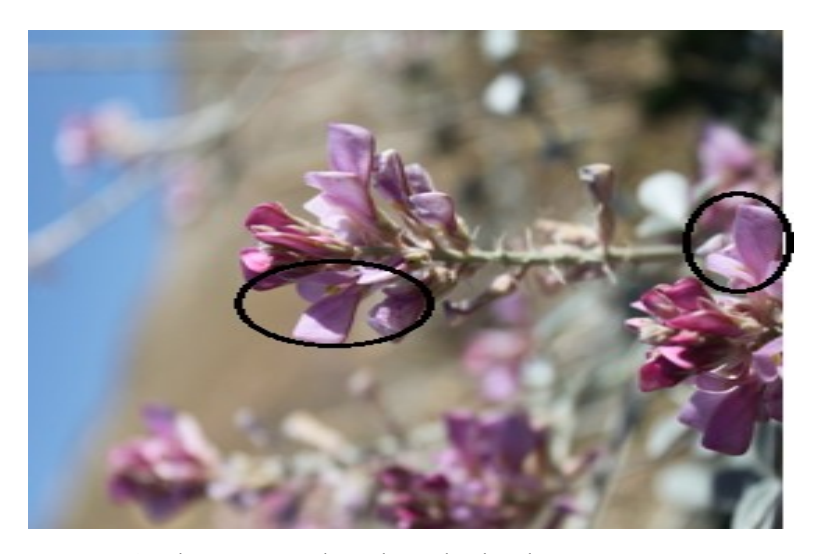
Figure 4. Shorter standart than the keel.

Although calyx teeth were defined as subulate in the Iraq and Iranian flora, in the examined samples, calyx teeth were identified as ovate or lanceolate. The inside of the calyx was determined to be white pannose hairy. H. singarense specimens collected from Turkey also differ significantly from other species by their frequent silver-fuzed body and leaves, shorter standard than the keel (Fig. 4, 5, 6).