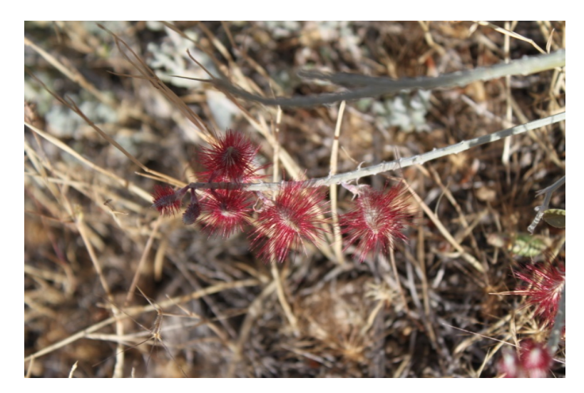
Figure 2. Fruit of H. singarense .