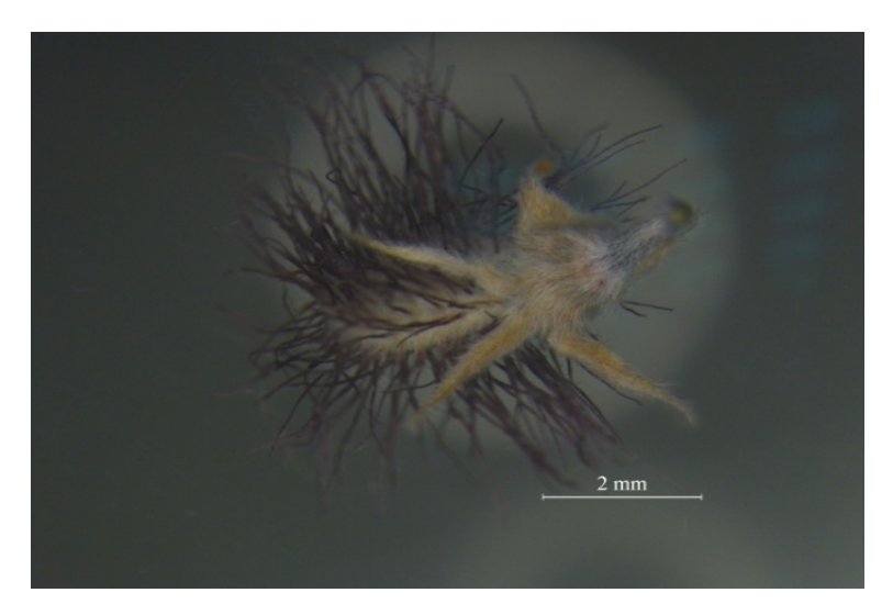
Figure 6. Subulate and white pannose hairy calyx.