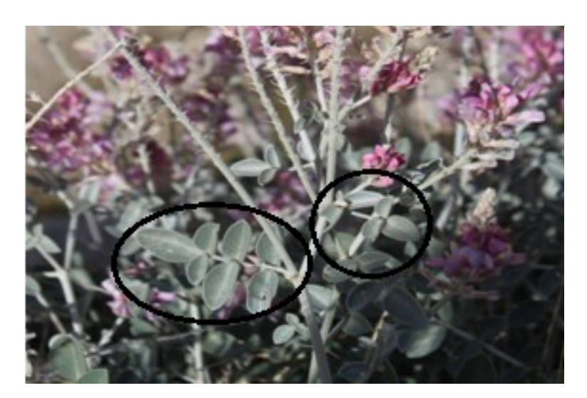
Figure 5. Multypartite leaves.