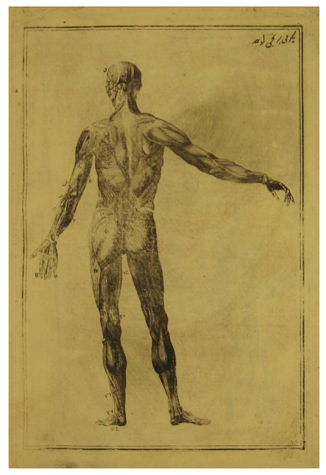
Fig. 3 . "The Outermost Order of the Muscle, Back View", in Şanizade, Mehmed Ataullah Efendi, Hamse-i Şanizade: Mir'atü'l-Ebdan fi Teşrih-i Azaü'l-İnsan . Istanbul: Daru't-Tıbaati'l-Amire.

Ottoman lands would make the successor scientists use more of the language of European medicine and consider "the old" as "ancient prejudice" (Yalçınkaya, 2015:33).