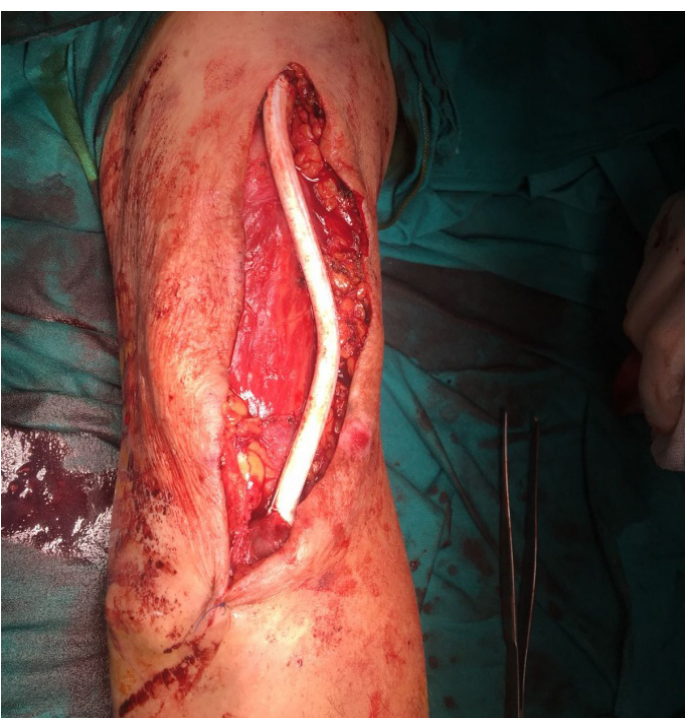
Figure 4. End-to-end anastomosis was performed between the proximal and distal portion of the AVF with 6 mm of Acuseal vascular graft.