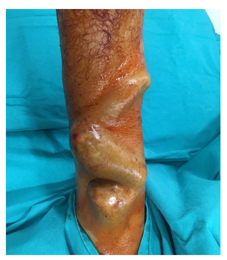
Figure 1. Preoperative massive aneurysmal arteriovenous fistula (AVF).