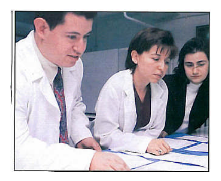
Figure3. Women as laboratory scientists

An important photo from NBS/Intermediate depicting Atatürk, the founder of the Republic of Turkey, dancing with his adopted daughter Nebile at her wedding in as early as 1929 best expresses his goal to improve the status of Turkish women and integrate them more thoroughly into the society.