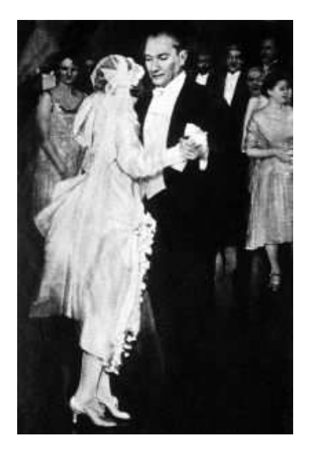
Figure 4. Atatürk dancing with his adopted daughter

An important photo from NBS/Intermediate depicting Atatürk, the founder of the Republic of Turkey, dancing with his adopted daughter Nebile at her wedding in as early as 1929 best expresses his goal to improve the status of Turkish women and integrate them more thoroughly into the society.