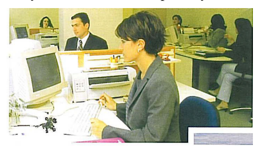
Figure 2. Women in the workplace

With respect to gender-typed behavior, it is possible to state that in the NBS series gender roles are not so strictly pronounced. In other words, students are presented images that are quite distant from traditional gender roles, which is a reflection of the great strides Turkish women have made in social life. It is true that the role of women in Turkish society has changed greatly in recent years and women have begun to enter the workplace in increasing numbers. At all levels of the NBS series, women who were generally viewed as mothers and homemakers in the past are portrayed as active participants of business life, indicating that gender stereotypes are fading away both at home and especially in the workplace: