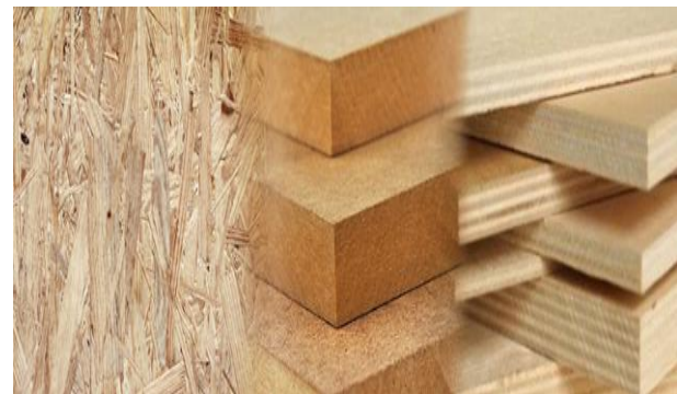
Fig. 1. Wood Composite Materials.

The aim of the paper is to predict wood composite materials such as particleboard, fiberboard, oriented strand board and plywood by using radial basis function (RBF) neural network. Particleboard, fiberboard, oriented strand board and plywood used in this study are shown in Fig. 1. Four physical and mechanical properties such as the board density, bending strength, bending elastic modulus and tensile strength were used in the prediction of the wood composite materials.