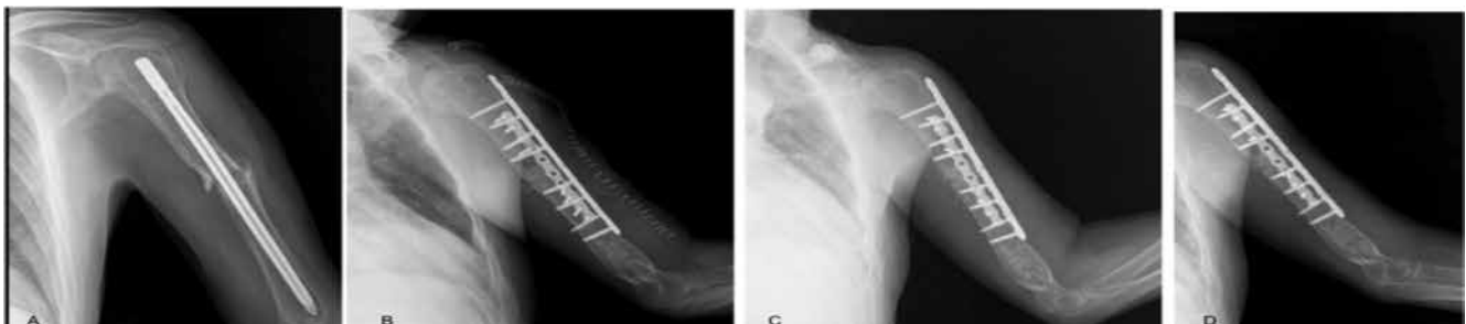
Figure 1. A left humeral shaft fracture, sustained during a fall, in a 54 year old man, with initial treatment with intramedullary nail. The non-union repair was performed 80 months later and included removal of the nail, decortication, autogenous bone grafts, and two-plate fixation. A) Radiolucent area around the nail was present on the preoperative lateral radiograph; B) radiograph immediately after surgery; C) radiograph at 1 month, postoperatively; and D) radiograph at 3 months postoperatively, showing evidence of fracture consolidation

Relevant demographic and clinical features of the patients forming our study group are summarized in Table 1. The study group included six females and four males with a mean age of 52.6 years (range: 36-70 years). One patient had a history of hypertension and one patient with hemiplegia had a history of epilepsy. The etiology of fractures included low-energy trauma (two patients), motor vehicle accident (six patients), and falling from a height (two patients). One patient had been treated conservatively and nine patients had undergone one-to-three surgeries in an attempt to obtain union of the fracture before admission to our institution (Figure 1). Previous surgical treatment included intramedullary nail fixation, external fixation and single-plate fixation. The average time between initial fracture and non-union repair was 46.5 months (range: 6 to 102 months) (Figure 2). The mean follow up time after non-union repair was 45.7 months (range: