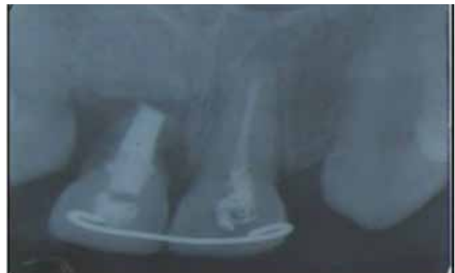
Figure 3. Radiographic view of teeth after filling with calcium hydroxide+iodoform root canal material