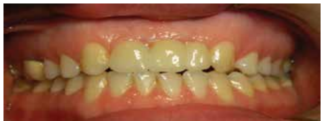
Figure 7. Clinical view of the fixed prosthesis