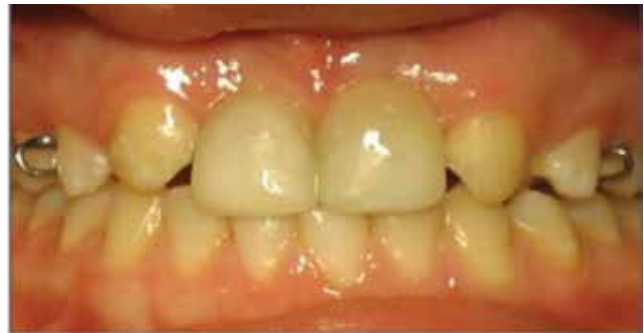
Figure 6. Intraoral view of the space maintenance

The incidence of more than one trauma in Southern Turkey is 5% (3). In their study, Andreasen et al. (4) have reported that 7.5% of patients had multiple traumas during the healing process, and thus, repeated traumas caused new fractures and affected the