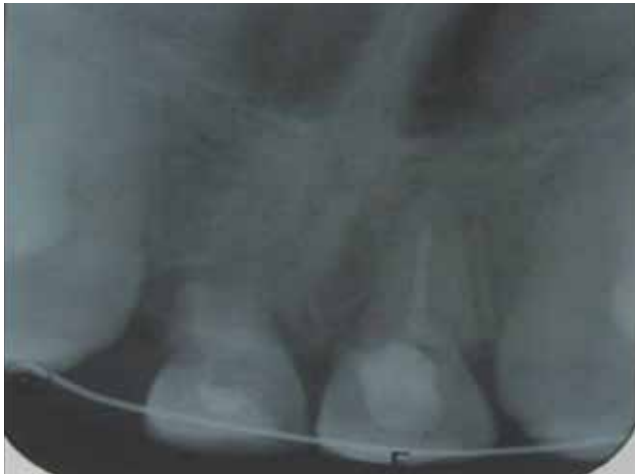
Figure 4. Radiography of the patient after third trauma

On October 2005, the patient presented with third trauma by colliding with her school mate. On the clinical examination, increased sensitivity and resorption of the right central incisor, and coronal and apical root fragment part of 1/3 of the left central teeth were observed. Both of the central teeth showed excessive mobility (Figure 4). Clinical and radiographic findings required extraction of the traumatized incisors, following extraction of the anterior tooth, fabrication of partial space maintenance for the aesthetics and function. The patient and the parents approved the usage of clinical crowns for the space maintenance. Due to color change, the tooth was bleached by sodium perborate. Simultaneously, tooth surfaces were total-etched with 37% phosphoric acid. An adhesive (Dentsply, Konstanz, Germany) was applied to the etched surfaces in accordance with the