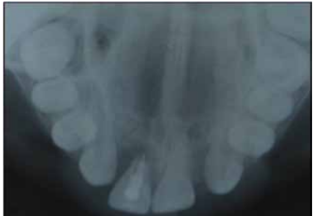
Figure 2. Radiographic view of the patient at first visit