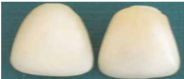
Figure 5. View of the natural crowns after composite application

manufacturer's recommendations. After that, a thin layer resin composite material (Valux, 3M) was placed into the crown and light cured for 40 seconds each (Figure 5). Oral hygiene instructions were given to both the patient and parents. The use of the appliance apparently caused no lack of comfort and the patient was highly motivated by the esthetic result as well as enhanced ease of biting (Figure 6). Until the fixed prosthesis was fabricated, space maintenance was repeated for two times. When the patient was 21 years old; implant-supported fixed prostheses were placed for the maxillary anterior region (Figure 7, 8).