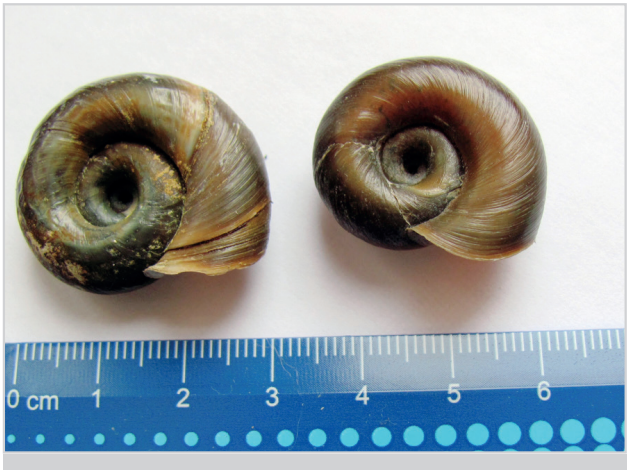
Figure 4. Shells of Planorbis corneus (Linnaeus, 1758)