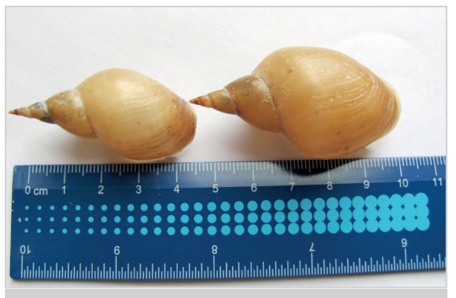
Figure 3. Shells of Lymnaea stagnalis (Linnaeus, 1758)

(Figure 2); L. stagnalis (Figure 3), L. truncatula and P. corneus (Figure 4) – for pathogens Paramphistomidae sp.; S. pfeifferi (Figure 5), sometimes may be an intermediate host of the dicrocoeliosis' pathogen ( Dicrocoelium lanceatum ) (Charlier et al., 2016; Dreyfuss et al., 1999; Faltýnková et al., 2008; Hodasi, 1972; Vignoles et al., 2016; Zhytova and Kornyushyn 2012).