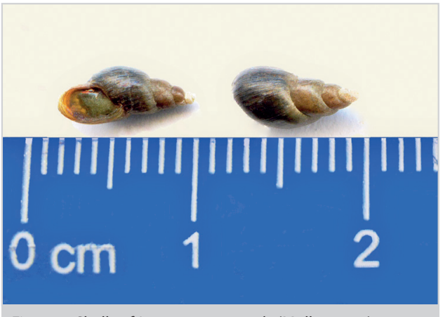
Figure 2. Shells of Lymnaea truncatula (Muller, 1774)

So, the study of the epizootology of ruminant animals' trematodoses and freshwater fauna is closely interrelated and the provision of quality products and profitability of cattle breeding in endemic areas is impossible without comprehensive knowledge about ecology of the gastropods.