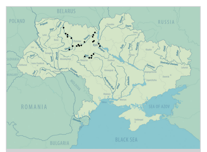
Figure 1. Points of mollusks' collecting at nothern regions of Ukraine (Dnipro basin)

In Ukraine, the northern Polissya regions, geographical center of which is in the territory of Kyiv and Zhytomyr regions, are characterized by the largest species diversity of gastropods in the small rivers of the Dnipro basin (Zhytova and Kornyushyn, 2017). It causes a severe enzootic situation with Trematoda invasions of large and small ruminants in this zone.