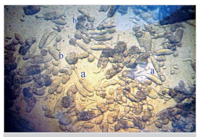
Figure 6. a, b. Parasitic trematode larvae (Trematoda: Digenea) in the liver of mollusk Lymnaea truncatula (Muller, 1774): a) mature cerkarias; b) young cerkarias

The data obtained is illustrated in Table 1, from which it is evident that part of the representatives of the species L. truncatula (up to 36.3%) was affected by rediae and cercariae of F. hepatica (Figure 6); up to 23.5% of L. stagnalis mollusks contained parthenogenetic genera of both F. hepatica and Paramphistomum sp. in hepatopancreas; some specimens of gastropods of the