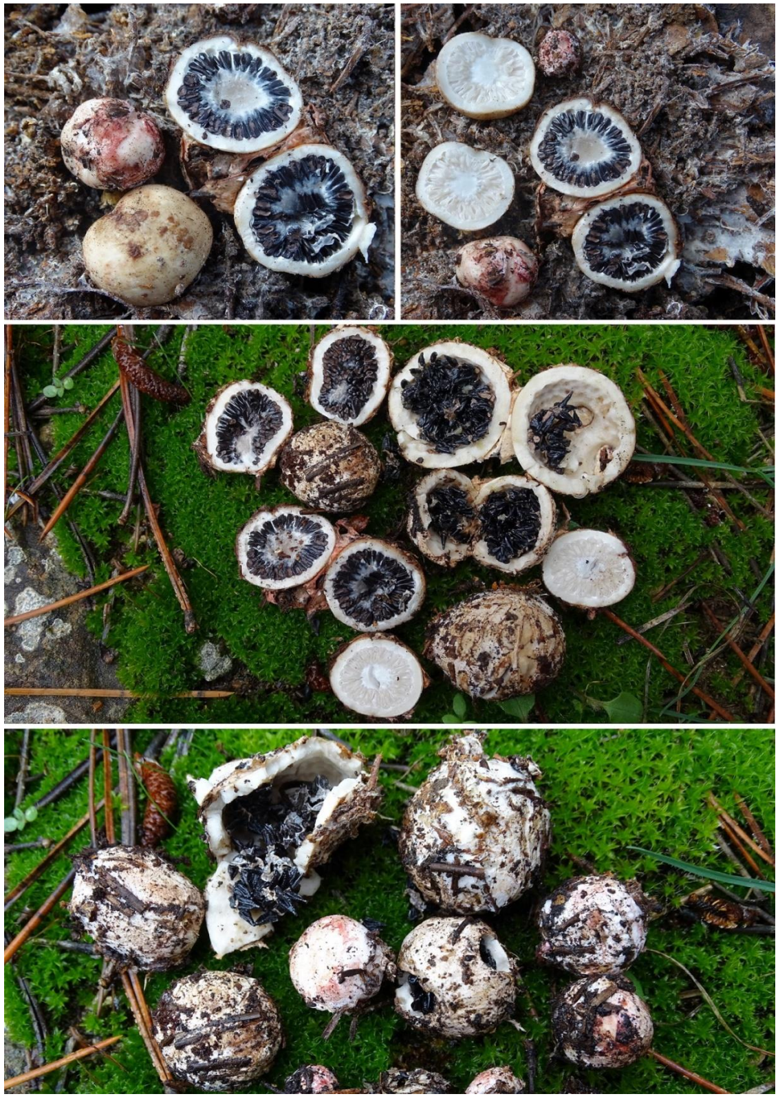
Figure 3. Basidiocarps of Schenella pityophila

Central district, Esenyurt Village, mixed forest, in soil under Alnus sp., 40°53'N-39°45'E, 745 m, 30.08.2018, Yuzun 6740; 40°54'N-39°45'E, 660 m, 02.09.2018, Yuzun 6754.