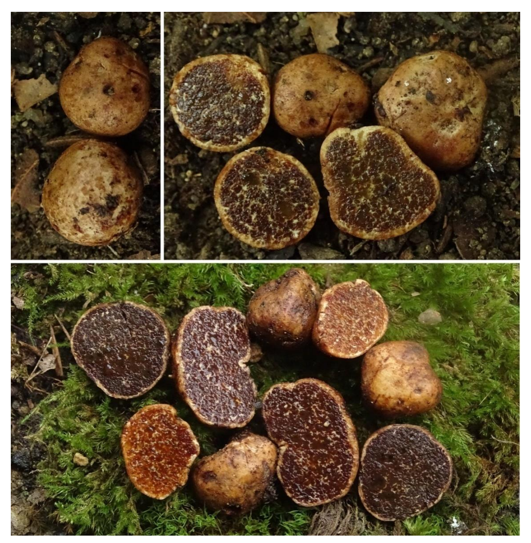
Figure 1. Basidiocarps of Alpova diplophloeus

Specimen examined: Turkey – Rize, Ardeşen, Yukarıdurak Village, mixed forest, in soil around Alnus sp. roots, 41°05'N-41°06'E, 925 m, 12.08.2017, Yuzun 5782; Trabzon, Tonya, Erikbeli Village, mixed forest, in soil around Alnus sp. roots, 40°45'N-39°14'E, 1680 m, 22.09.2015, Yuzun 4610; Yomra, Özdil Village, Alnus sp. forest, 40°50'N-39°48'E, 1210 m, 25.08.2018, Yuzun 6684;