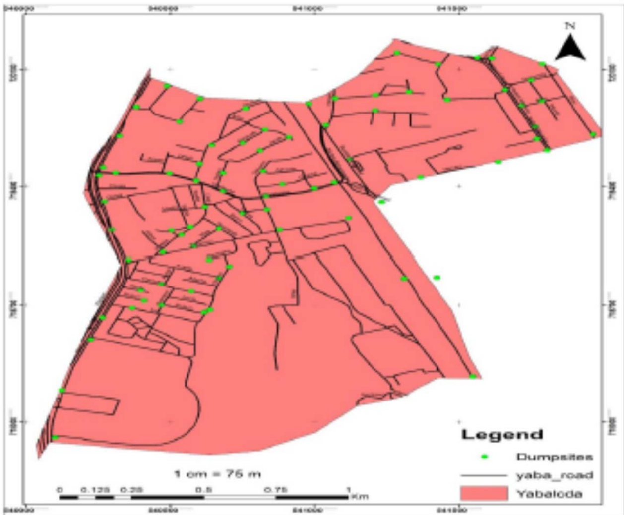
Figure 2: Spatial distribution of the waste dumpsite in Lagos Mainland

From the figure 3 above, the diagram represents a conceptual model for solid waste collection system and in order to make GIS a veritable tools in solid waste collection system application, a number of tools are needed which are sensitive to management of the process. This includes resources, organisation, information and coordination. Invariably GIS would become essential and powerful veritable tools in solid waste collection if all the aforementioned items are in place.