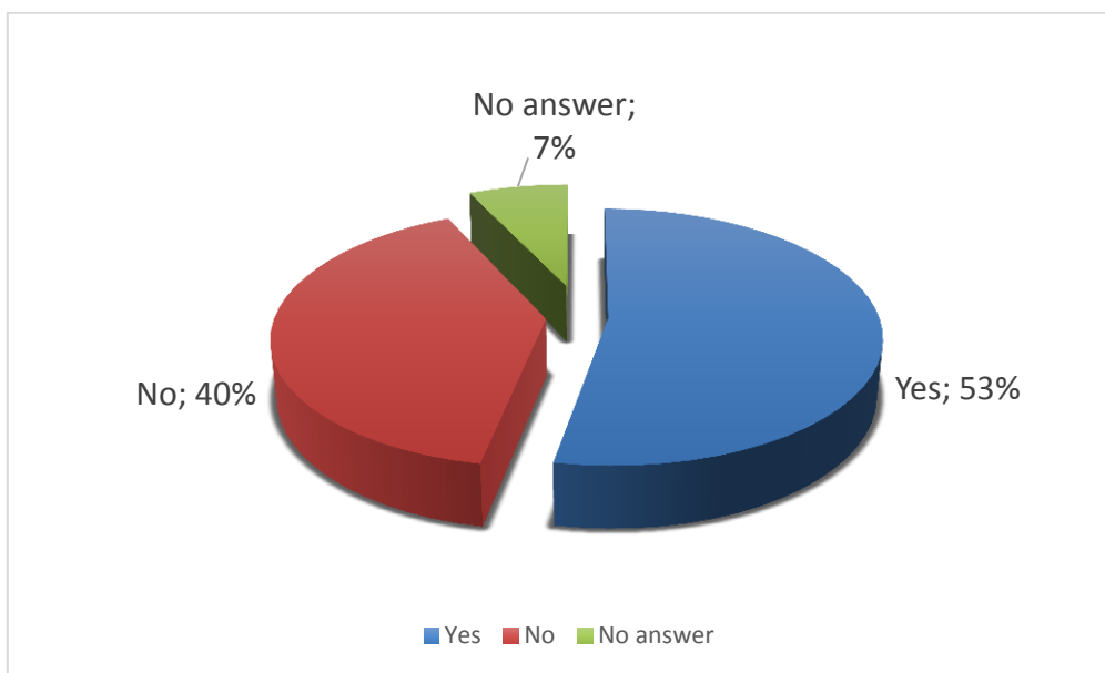
Figure 2. Can you still use the ICT skills that you learned from your study?

As the results show, using PhenoBL can improve the students' understanding, and engagement of the taught subject increases thus improves their learning capabilities and skills. This fact is also supported in previous researches done in this area (Francis et al., 2013; Symeonidis & Schwarz, 2016; Valanne et al., 2017). After the exams, we had an interview with participated students in and asked them about whether they still can use the skills that they learned in the ICT while studying. The answers are shown in Figure 2.