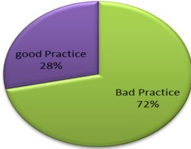
Figure 2. Breast self-examination skills of the participants.