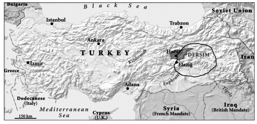
Approximate area encompassing the Sheikh Sa'id of Piran Rebellion