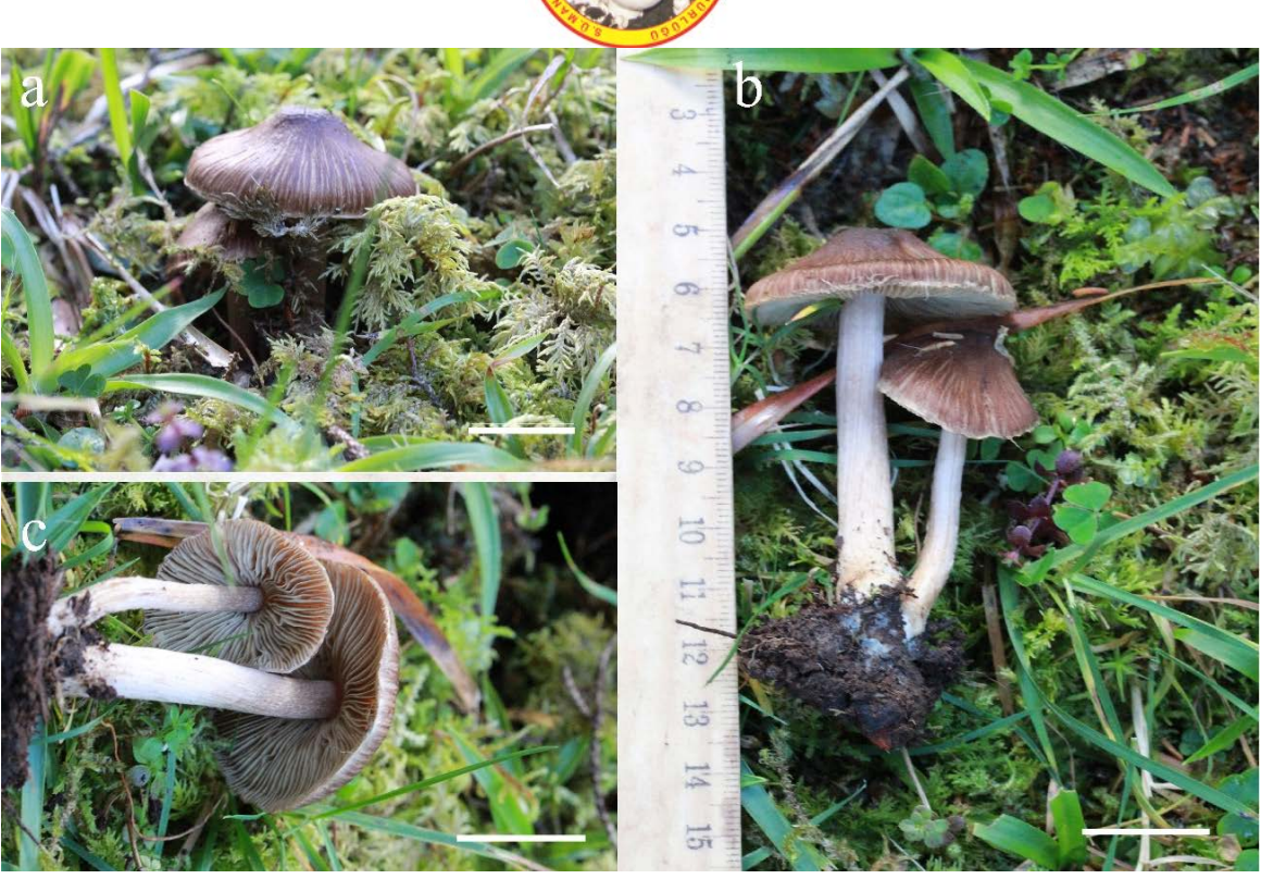
Figure 1. Inocybe sphagnophila : a, b and c. basidiomata (scale bars: 20 mm).