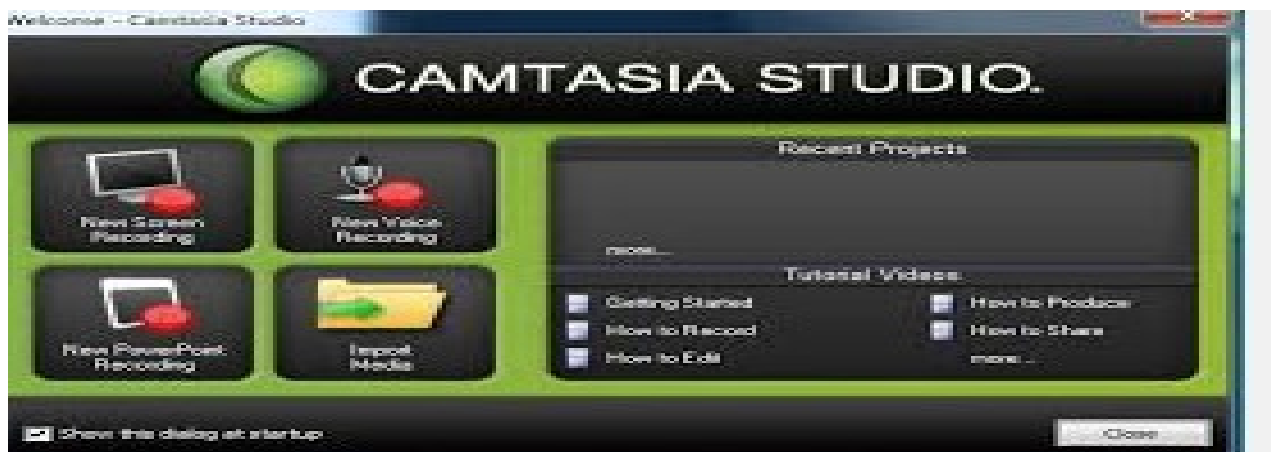
Figure 5. Camtasia studio

Camtasia is a user friendly TechSmith product which allows students to access computer generated audio visual training via online delivery. Both the screen and the voice are captured (see Figure 5 below). In some of the units a number of Camtasia recordings (audio/video) are used along with lecture recordings. These recordings are mainly used as a replacement of laboratory activities and to summarise topics included in unit content. Sometimes instruction about how to use a specific statistical tool or software are recorded in Camtasia and made available for students through Blackboard. Also in some of the recordings, responses to general queries about the unit are recorded and made available for all students through Blackboard.