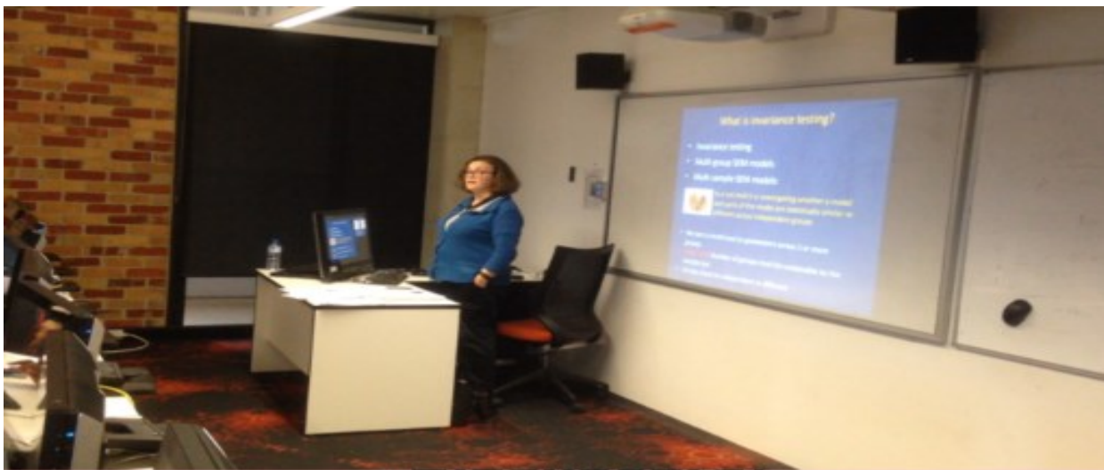
Figure 2. Face-to-face on campus lecture

On-campus face-to-face classes are offered for all postgraduate units at the Swinburne Hawthorn Campus in Melbourne for those students who can attend (see Figure 2 below). These sessions are offered in the evenings outside normal business hours. For the graduate certificate level units two day on-campus weekend workshops have been run during the study period so that all interested students could join the sessions, even those living interstate. These sessions are recorded through the Echo System and uploaded on Blackboard so that all students can watch the recorded lectures. On-campus evening classes (3 hours weekly) are offered for graduate diploma and masters level units throughout the study period. To improve the level of industry engagement guest lecturers are used in some of the units including the masters level unit called ‘Statistical Consulting’. These sessions are also recorded through Lectopia/Echo360 and made available for students through Blackboard. Learning occurs in face-to-face sessions through the study period with online recordings of these sessions also available to all students.