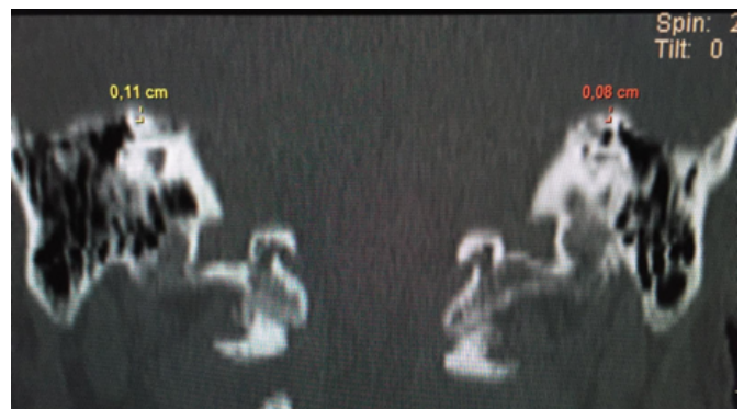
Figure 3: Bilateral SSCD coronal reconstruction view. Sizes of right and left ear dehiscences were shown.