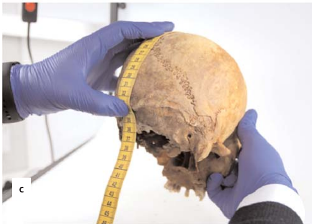
Figure 1. Samples of the measurements made on a dry skull. (a, b) The distance between nasion (intersection of the frontal bone and two nasal bones) and bregma (intersection of the coronal suture and the sagittal suture). (c) The distance between nasion and inion (the highest point of the external occipital protuberance). [Color figure can be viewed in the online issue, which is available at www.anatomy.org.tr ]

unknown age and gender were obtained from the Laboratory of Human Anatomy, Istanbul University School of Dentistry, Istanbul, Turkey. The CT images were obtained from patients who underwent CT angiography for a suspicion of a ruptured aneurysm at the Department of Neurosurgery of Marmara University, Istanbul, Turkey, from January 2012 to December 2014. Of the 100 patients, 48 were males and 52 were females, and the mean age was 53.39 (range 18–85) years.