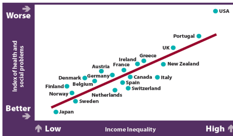
Figure 1. Health and Social Problems are Worse in More Unequal Countries.

(Note: the above uses the ratio of income between the top and bottom 20% of income after tax as a measure of inequality, but other measures produce similar results).