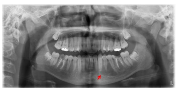
Figure 1. Panoromic radiography is showing the lesion (red arrow)

A 17-year-old male patient was referred to our faculty with the chief complaint of infection in his left mandibular first molar tooth. He had no significant health problem, drug intake, or trauma history. Radiographic examination revealed a lined, unilocular radiolucent area between the canine and the first molar region on the left side of the mandible (Figure 1). The canine and the first and second premolar teeth were vital and painless. On palpation, expansion of the buccal bone was appreciable. The pulp in all four of the related teeth continued to remain vital. The patient underwent surgery. Under local anesthesia, a mucoperiosteal flap was raised. After osteotomies, the bone cavity was exposed. The surgery indicated that the lesion was an empty traumatic bone cavity. Surgical exploration of the cavity, along with the inducing of bleeding points, was performed. Any type of graft material was used. Three months after surgery, bone healing was clearly seen on the panoramic radiography (Figure 2).