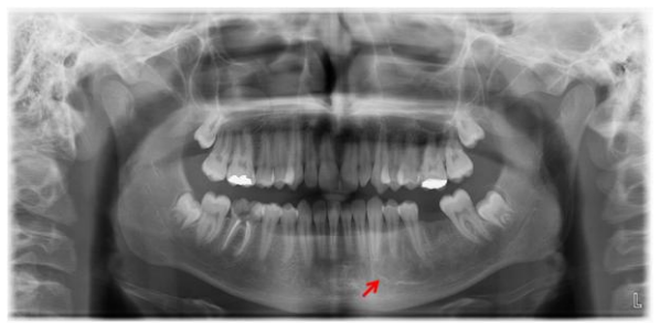
Figure 2.Panoromic radiography of the patient; three months after surgery