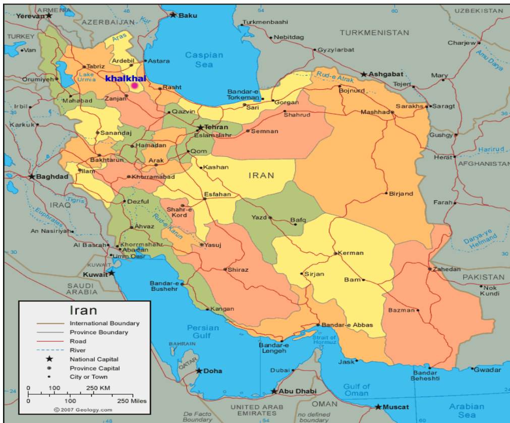
Map 1. Khalkhal country's geographical location.

The study area is khalkhal city that from the north to Kosar city and from the East to Gilan province and from south to Zanjan province and from west to the mianeh city Connected. The city is at longitude 48 degrees 32 minutes and 37 degrees 37 minutes latitude of Greenwich meridian located. And one of the most strategic areas that have unfortunately been neglected for many, this area of the divisions is as follows. This region is a mountainous region that its height decreases from East to West and North to South. Talysh Mountains in the East it is stretched from north to south that as a barrier between the Caspian Sea and is located in Gilan and Azerbaijan province. So that unlike the Eastern Slopes, in the western foothills to reduce rainfall and dry air, not seen Luxuriant and significant vegetation. In this city main river same Qizil Owzan And its branches as shahrud, arpachay and shengabad to south flow And finally shed to the Caspian Sea. This area of climate, is with mild summers and cold winters. In terms of geographical locations and mountainous, this area has the coolest hot mineral water sources that most important of that is mineral water khalkhal that is in distance between cities khalkhal and Givi. [Wikipedia, 1393]