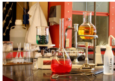
Figure 2: Legend for figure 2