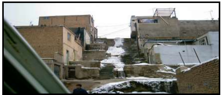
Figure 2. Status access in marginalized areas of Tabriz.

In explaining this issue, sustainable development in the field of buildings on the land has interesting ideas and about this, the first criteria is, how to create "stability" in the building and the second criteria, "to build infrastructure and superstructure". In steep slopes, that the buildings through the step narrow alleys to provide access and to reach for an emergency ambulance and fire engine during fire is impossible life is not established. In this regard, the residential quality is important, which include: (1) consistency, (2) stability (building relationship with the environment), (3) access, (4) Enough light and good prospect, (5) Possible implementation of facilities, water, electricity, telephone and sewage, (6) territory, (7) identity, (8) privacy (9) convenience and (10) security. None of the 10 qualitative cases is not visible in the considered textures because in this textures are not used (Mojtahedzadeh, 1368: