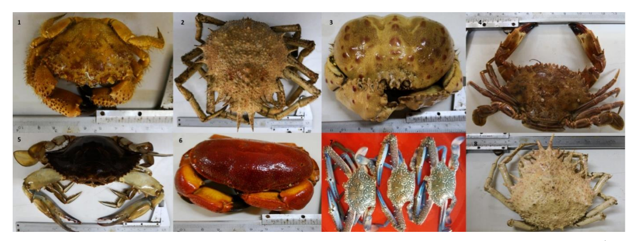
Figure 2. Some brachyuran crabs from the coastal waters of Mersin Bay. E. verrucosa<sup>1</sup>, M. squinado<sup>2</sup>, C. granulata<sup>3</sup>, C. longicollis<sup>4</sup>, C. sapidus<sup>5</sup>, A. roseus<sup>6</sup>, P. segnis<sup>7</sup>, M. crispata<sup>8</sup>

In this study, eight brachyuran crab species, E. verrucosa , C. sapidus , M. squinado , M. crispata C. granulata , were found in Mersin Bay (Figure 2).