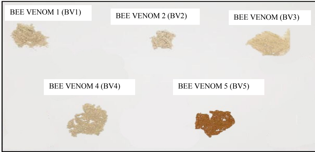
Figure 1. Bee venom samples

The bee venom used in this study (Fig. 1) included two commercial bee venoms and three bee venoms specially produced by Anatolian beekeepers, collected by electroshock in 2018 and kept at -18 °C in the dark.