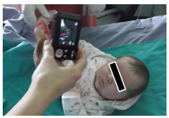
Figure 7. Every step of the treatment of our patients were recorded

We got the visual records of the patients,