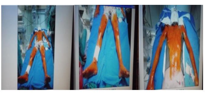
Figure 3. A sample of photo recording of a patient

photography in a burn center. We also aimed to guide the work to be done by future burn centers.