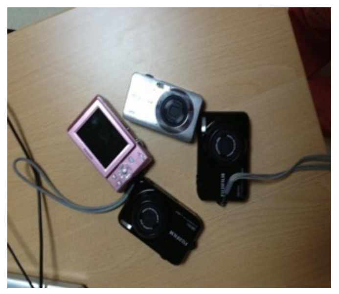
Figure 2. Digital cameras for recording