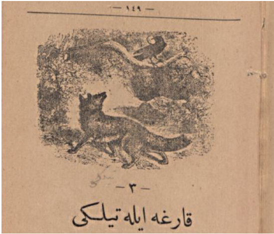
“Crow and Fox”