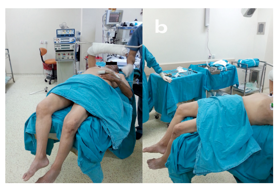
Figure 1. Positioning the patient in the supine position with the knees flexed