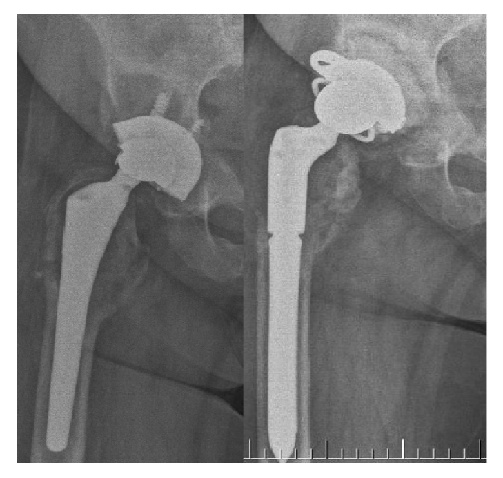
Figure 1: Preoperative and postoperative radiographs of the Case I revealing periprosthetic osteolysis and asymmetric thinning of the metal femoral head, also metal corpora libera originating from the metal head is lying adjacent to the lateral border of the head.

The patient was an active teacher. She weighed 56 kg and was 167 cm tall. Neurovascular system examination was normal. She had a positive trendelenburg sign and antalgic gait. Although her active flexion was limited to 80° with 0° of rotation, passive ROM was unrestricted but painful at the end of the range with the exception of external rotation. External rotation was limited to 5°. Approximately 1 cm lower limb discrepancy was determined. A result of complete blood count and biochemistry was within normal range, except slightly high white blood cells. Erythrocyte sedimentation rate was 32mm/h, whereas C-reactive protein level was 3,7 mg/dl. Serum chromium, cobalt, and molybdenum levels were 0.77 ng/ mL, 0.24 µg/L and 1.20 µg/L, respectively. Preoperative radiographs revealed an uncemented THA with the metal head to be got thinner asymmetrically and deformed and an acetabular component with loosening and severe periprosthetic osteolysis. Periprosthetic osteolysis was also determined around the proximal part of the femoral component. (Figure 1)