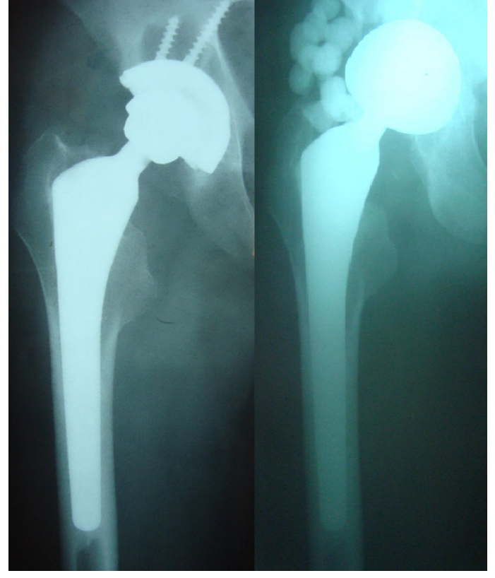
Figure 4: Preoperative and postoperative radiographs of the Case II revealing periprosthetic osteolysis.

was within normal range. Erythrocyte sedimentation rate was 13mm/h, whereas C-reactive protein level was 2,6 mg/dl. Serum chromium, cobalt, and molybdenum levels were 0.57 ng/ mL, 0.34 \mu g/L and 1.76 \mu g/L, respectively. Preoperative radiographs revealed an uncemented THA with severe perioperative osteolysis around the acetabuler component. (Figure 4)