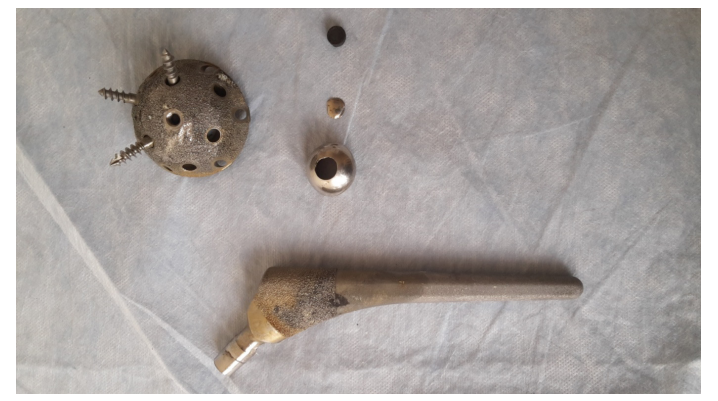
Figure 3: Asymmetrical wear of the metal head and the coin like free fragment originating from the head.