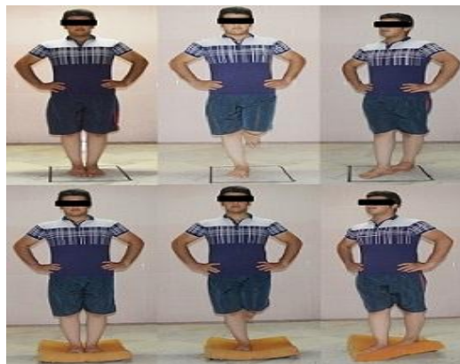
Figure 2. Balance error test (BESS) in six different situations

In this test, which is used to measure static, six different situations have been considered, including three positions standing on the hard surface and three standing positions on the soft surface. Hard surfaces include carpet or flooring and a soft surface, including a padded foam cushion with a size of 41 x 50 x 6 centimeters. Standing positions also include standing on both legs in pairs, standing together on both legs, one way back and standing on the same. In all situations, the eyes of the subjects are closed and the hands stick to the sides. The subject performs each situation for 20 seconds and calculates the total number of errors that occur in these six states as his grade. Errors include: detaching the hands from the waist, opening the eyes, lifting the heel or toes, relying on the ground, attaching or abducting more than 30 degrees of thumb, a collision of the foot with the ground, or a collapse of balance for any reason. Before performing the test, each subject performs three tests to getting known with the test (Bressel et al., 2007).