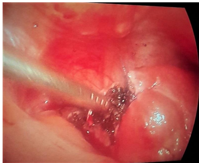
Figure 2: The sutured left cornu uteri

Estimated blood loss was 100 ml and the patient recovered without complication. The day after the operation, she was discharged uneventfully. Serum \beta -human chorionic gonadotrophin concentration decreased from 84,790 mIU/ml at the time of the operation to <1.5 mIU/ml in 4 weeks. The written consent was obtained from the patient presented in the study.