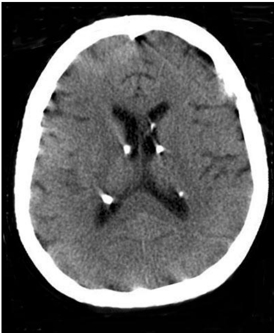
Figure 2. Cranial CT showed subependymal nodules.