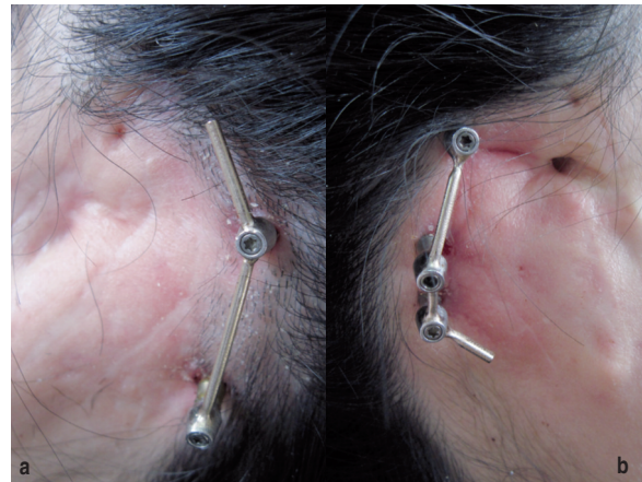
Figure 3. Dolder bar in place with passive fit for both sides

High success rates has been reported for the implants in the auricular site ranging from 93-100%. 6,11-14 The success criteria for craniofacial implants 15 was proposed by modifying dental implant success criteria described by Albertsson et al. 16 The clinical manifestation of osseointegration is the absence of implant mobility, both at placement and during function. Widely used clinical technique to determine craniofacial implant mobility is assessing the implant abutments manually for the presence of clinically detectable mobility by means of lateral application of pressure to the implant by two opposing instruments, and recording as positive or negative. However an objective method to measure stability of craniofacial implants might be beneficial. Measuring implant stability by means of RFA, a reliable, easy, predictable and objective method, primary and secondary stability of implants can be quantified. Therefore, in cases with low stability at placement or at the end of the healing period,