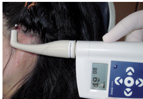
Figure 2. RFA measurement of one of the implants in the defect site

AG), up to 15 Ncm, as recommended by the manufacturer. The skin flap was sutured (Silk Suture, Boz; Ankara, Turkey) and gauze packing was applied. The peri-implant tissue was allowed to heal for 2 weeks.