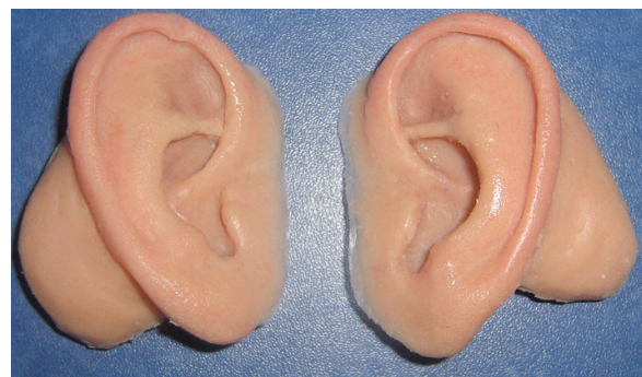
Figure 4. Silicone auricular prostheses