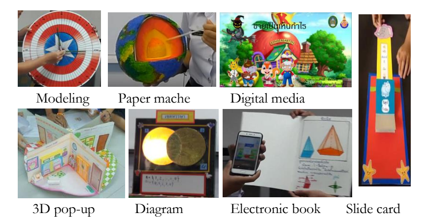
Figure 2 . Examples of Instructional Media

Table 3 showed that modeling suitable for large group learning, 3D pop-up suitable for small group learning, and digital media suitable for individual learning. In addition, the research also found types for instructional media there are modeling, 3D pop-up, paper mache, slide card, diagram, digital media and electronic book (Figure 2). Different group of learning reacts with types of instructional media (Mouw et.al., 2018). Even though new era of learning tend to be invite online learning or internet resources, the instructional media may be suitable to nature of learning and learning environments (Australia Government, 2009; Ennis et.al., 2018)