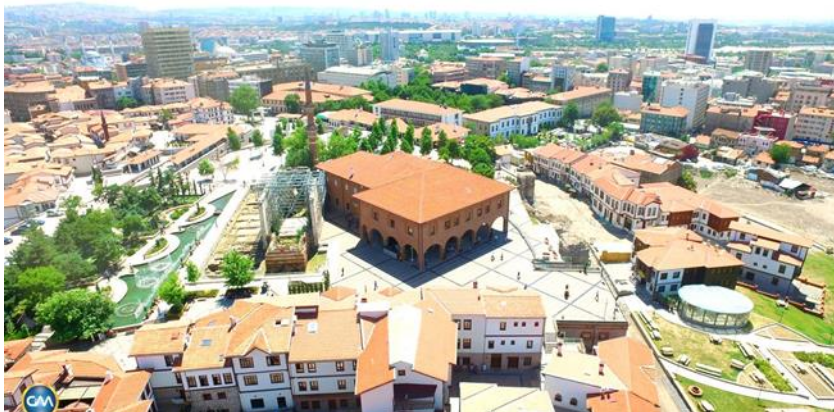
Photo 1. Side-by-side location of the August Temple and the Hacı Bayram Mosque on the sacred hill of Ankara City Center

Thus, the hill is the cultural heritage and identity area in present day. On the other hand, conservation of the ancient-sanctified structures as cultural heritage has never been a topic focused purely on immovable heritage. Beyond their visible character, going beyond an implicit and secret architectural code that expresses or transfers a message, such edifices possess a symbolic value and /or meaning via their sanctified