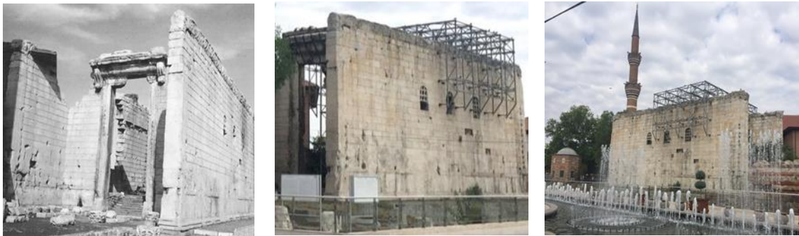
Photo 2. The Temple of Augustus in 2006 [27] and its current situation (view of the wall of pronaostan cella)

Today, the naos wall remains of Temple of Augustus are protected with the support of a metal cage. Concerns have been expressed about the results of this restoration dating back approximately fifteen years. The temple is exposed to irrevocable destruction caused by pollution along with an intensive influx of visitors, seismic disasters, climatic factors, and the roadway that passes by the sidewall of temple (Photo 2).