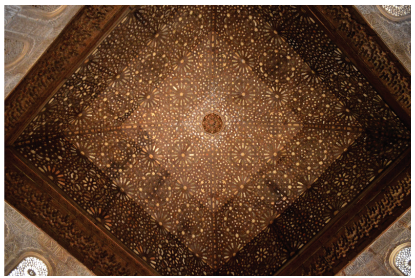
Figures 3-4 The Comares Hall, Alhambra, art Nasrid, fourteenth-century, Granada, Spain. Photos in public domain.

The primal intention of inscribing this particular surat on the walls of the audience room was obviously to produce a political-religious discourse centered on the trope of kingship. In this context, the surat function as a reminder about the