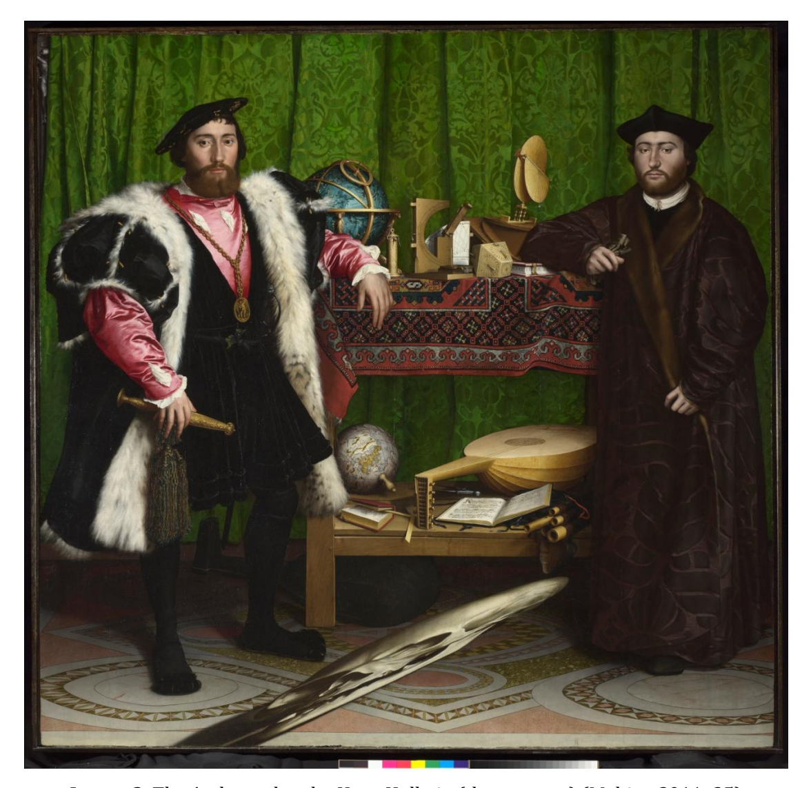
Image 3. The Ambassadors by Hans Holbein (the younger) (Mahiet, 2011: 25)

The sources also show that it was not only Western countries, but also Ottoman rulers, used music in diplomatic relationships.