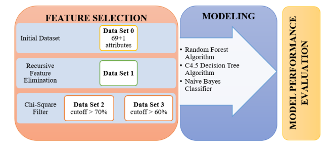
Figure 1. The summary of machine learning analyses in this study

At this stage, the models that are appropriate to the solution and the nature of the problem are selected. By finding the best parameters of the algorithms to be used in the model, experiments are made to give the best result. The summary of machine learning analyses is given in Figure 1.